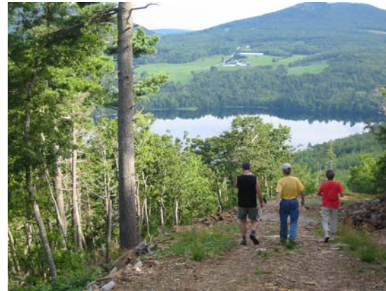
View from Hatchet Mountain trail.

Or Click on "Support Conservation" @ www.coastalmountains.org