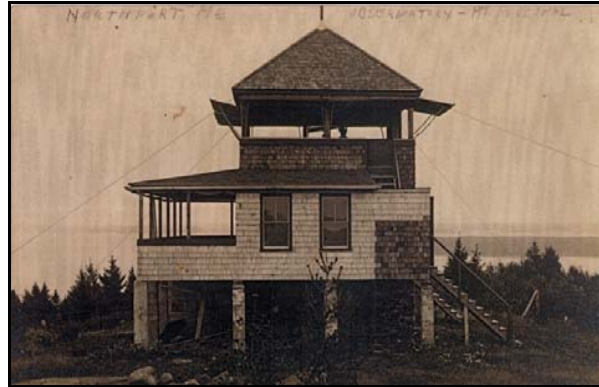
photo: original Mount Percival tower, early 1900s.

Or Click on "Become a Member" @ www.coastalmountains.org