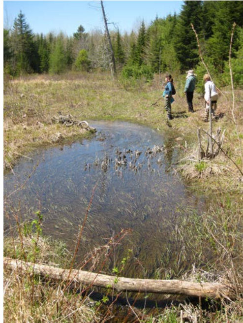
Hikers enjoying the view at Long Cove

Or Click on "Become a Member" @ www.coastalmountains.org