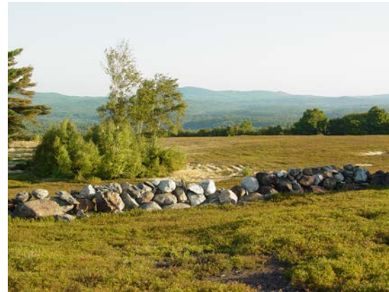
View from summit of trail.

Or Click on "Become a Member" @ www.coastalmountains.org