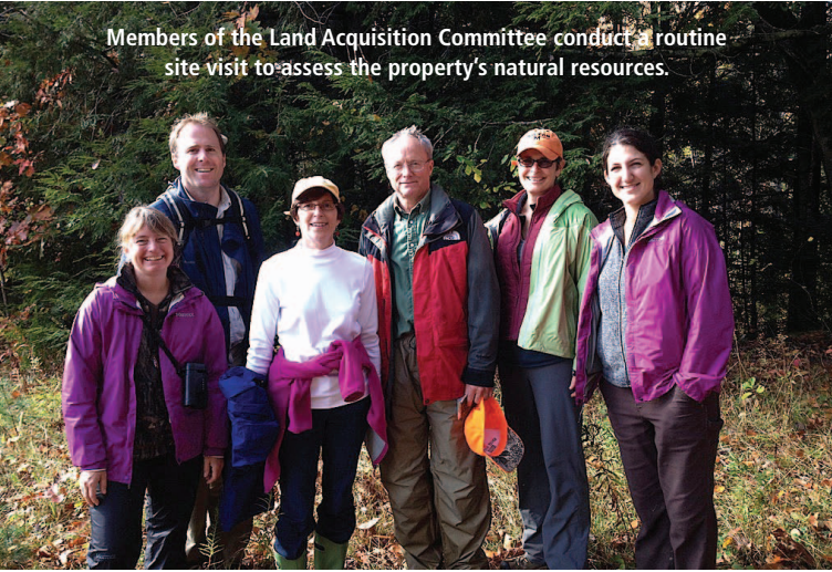
Members of the Land Acquisition Committee conduct a routine site visit to assess the property’s natural resources.