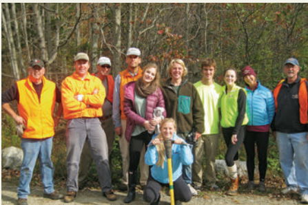
Last fall volunteers from West Bay Rotary and the Camden Hills Regional High School Interact Club helped us out with trail work on Bald Mountain.