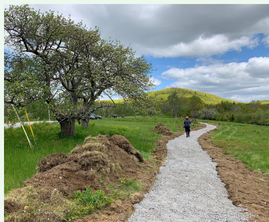
Early work on Round the Mountain Trail at Hope Street Trailhead.

Beyond conserving natural spaces for wildlife, protecting places that people walk as part of their daily routine is one of the things I am proudest of while working at the Land Trust. From the Belfast Rail Trail to Beech Hill, our preserves provide great spaces for people to get outside, slow down, and clear their heads. Right now, our Land Trust