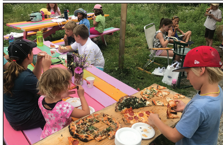
2018 Pizza & Paint at Bok Farm!