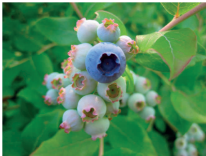
Coastal Mountains Land Trust