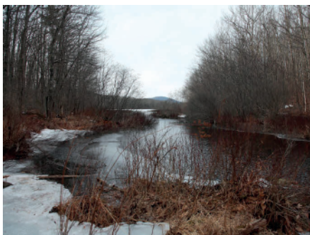
Coastal Mountains Land Trust