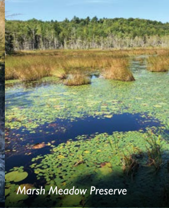
Marsh Meadow Preserve